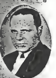
Damon Keaton Restaurant